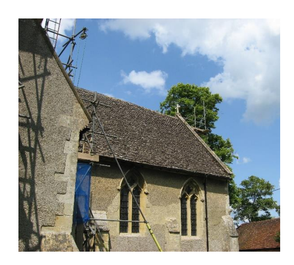
The extension door, site of flooding