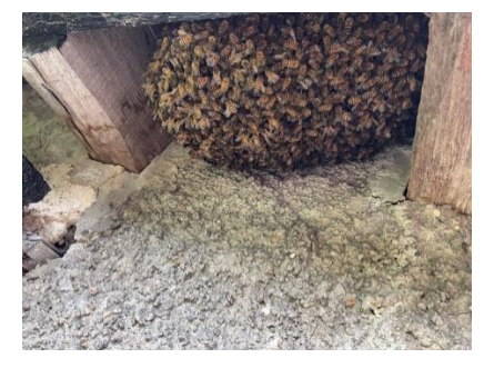
Photo: Bees under the eaves, May 2021

Examples of other work are in the Fabric Report.