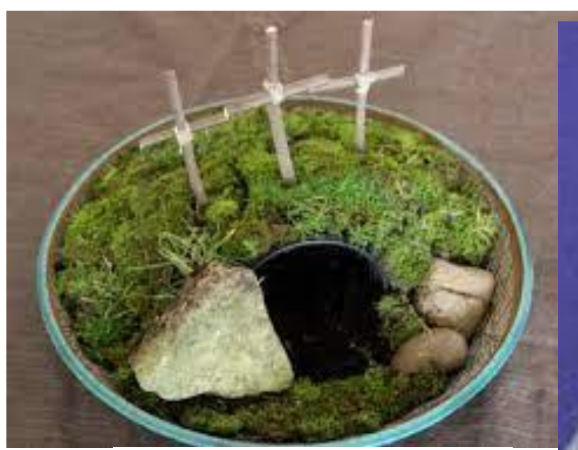
Make your own Easter Garden...