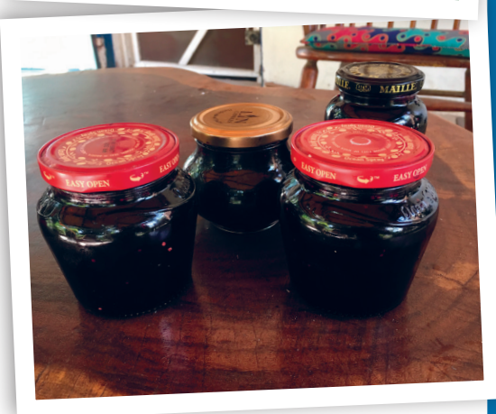
Photos from top to bottom: Water is precious; line of mulberry bushes; mulberry fruit; mulberry jam