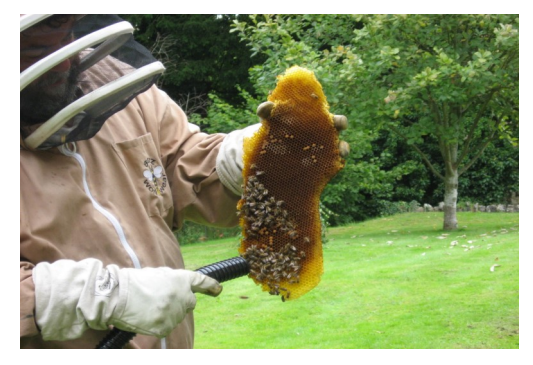
Pest Solutions could not identify exactly where the bees were.

As the end of August approached something had to be done, because the work to repair the roof was planned to start in September and the bees were making it clear that they did not wish to be disturbed. Unfortunately Shire